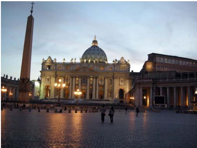
The Vatican At Night