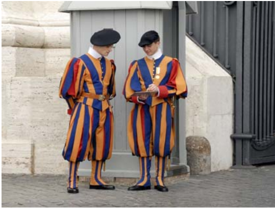
Swiss Guards at the Vatican