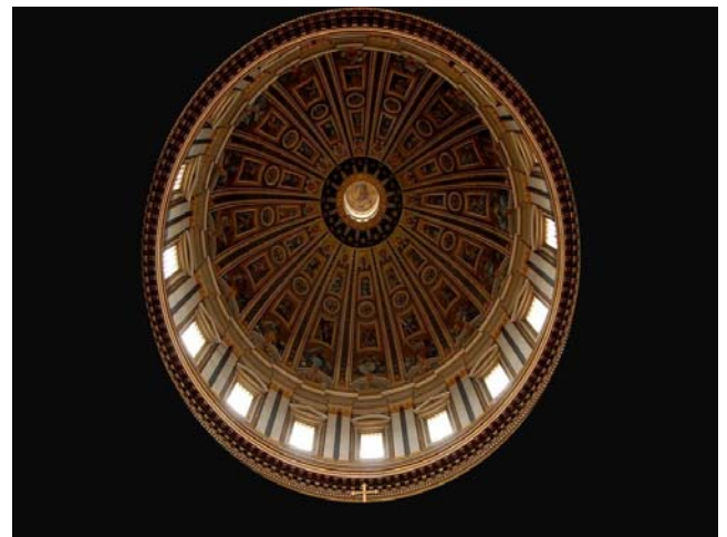
The Dome of St. Peter's Basilica